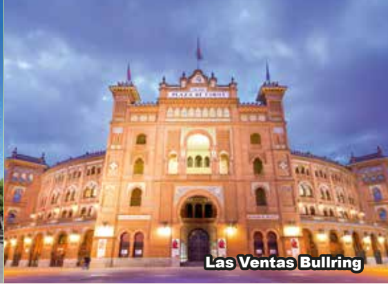
Las Ventas Bullring