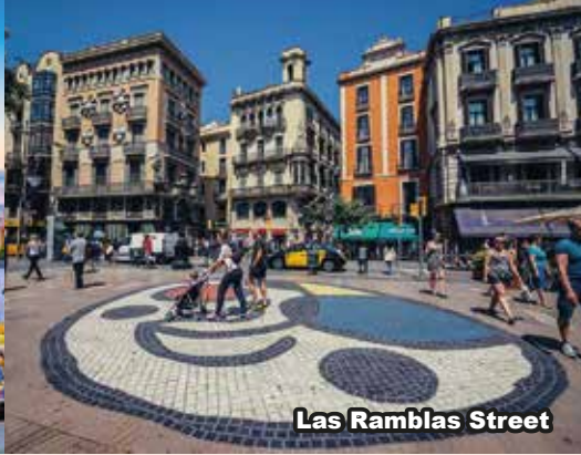
Las Ramblas Street