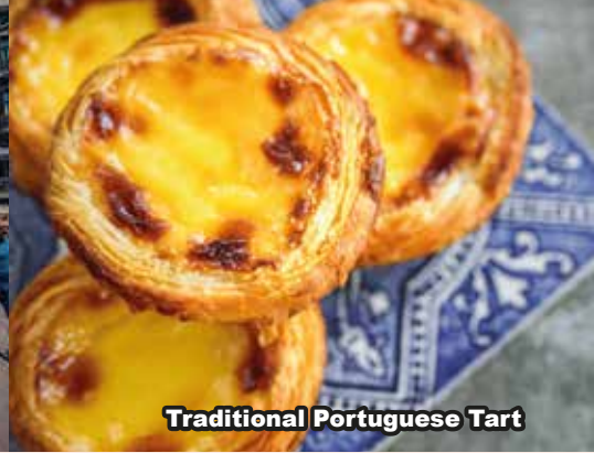
Traditional Portuguese Tart