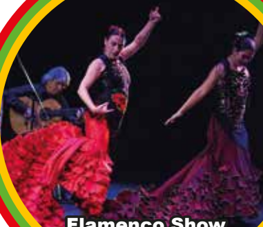
Flamenco Show & Dinner