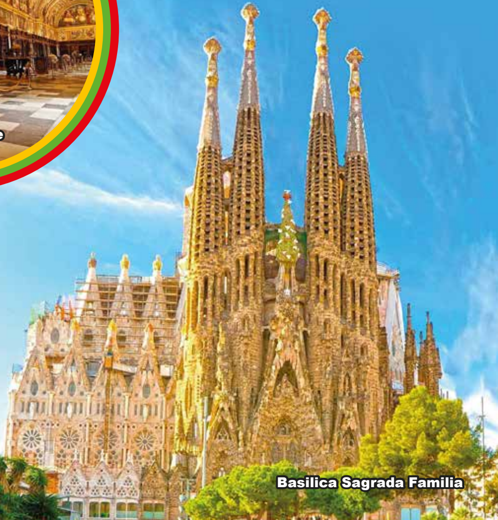
Basilica Sagrada Familia