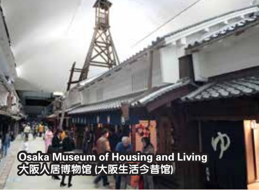
Osaka Museum of Housing and Living 大阪人居博物馆 (大阪生活今昔馆)