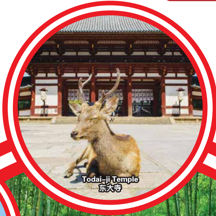
Todai-ji Temple 东大寺