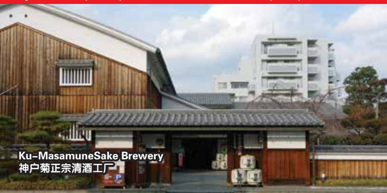
Ku-Masamune Sake Brewery 神戸菊正宗清酒工厂

[The below optional price is based on the number of participants; And for child price are same as the adult price (Except infant who does not occupy the seat)]