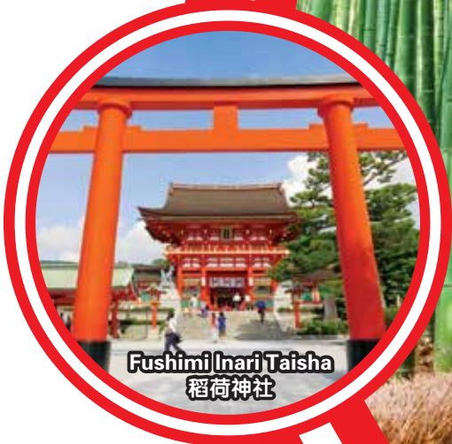
Fushimi Inari Taisha 稻荷神社