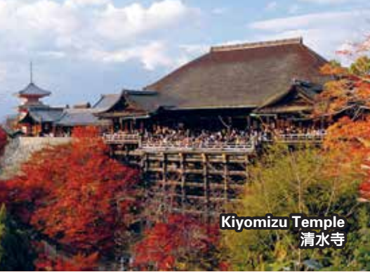
Kiyomizu Temple 清水寺