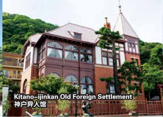
Kitano-ijinkan Old Foreign Settlement 神戸异人馆