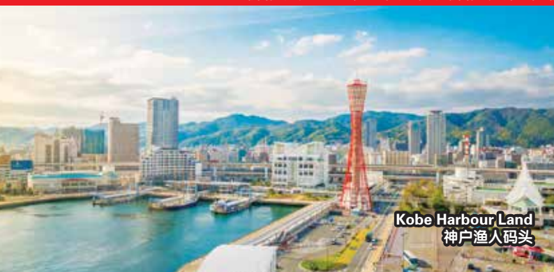
Kobe Harbour Land 神户渔人码头

自费行程: 美山町合掌村、锦市场、心斋桥、道顿堀。JPY 10,000/人 【价格以参加人数为准; 小孩价格与成人同价 (除婴儿外, 手抱婴儿不占座位不收费)】