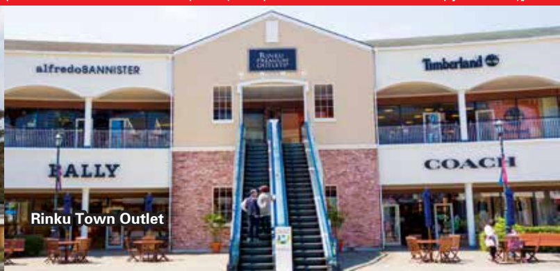
Rinku Town Outlet