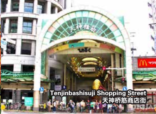
Tenjinbashisuji Shopping Street 天神桥筋商店街