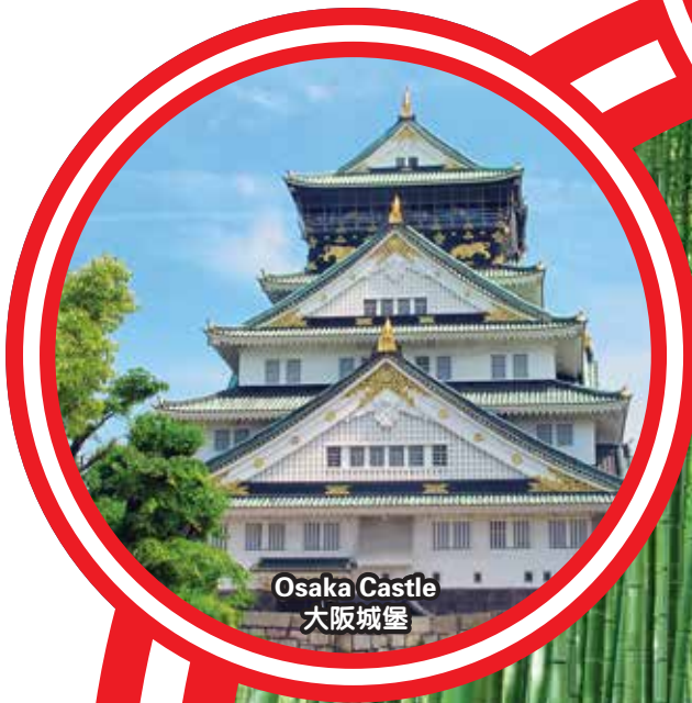
Osaka Castle 大阪城堡