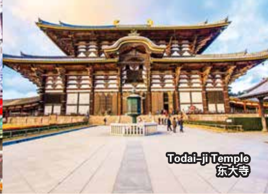
Todai-ji Temple 东大寺