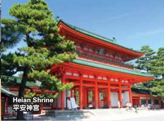
Heian Shrine 平安神宫