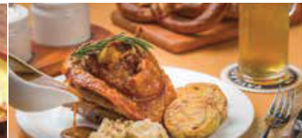
3 Course Meal –German Lunch with Pork Knuckle